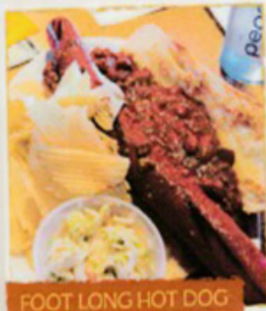
FOOT LONG HOT DOG

Bacon Cheeseburger Wrap Ground beef, bacon, cheddar cheese, lettuce, tomato and Vidalia dip 8.95