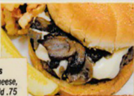
MUSHROOM & SWISS

The Big Gateway* ½ lb. of fresh ground beef topped with bacon, mushrooms, American and Swiss cheese 9.99