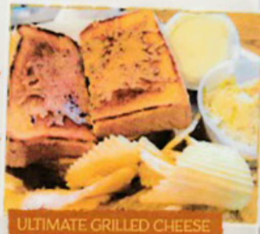
ULTIMATE GRILLED CHEESE

Served with ripple chips and cole slaw. Substitute crinkle cut fries, cottage cheese, soup or salad for the chips add 2.00 Vidalia Dip add .75